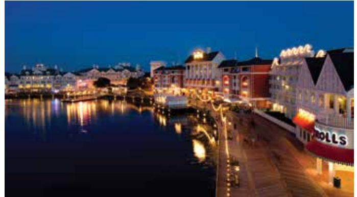
As to Disney properties/artwork: © Disney

Looking forward to seeing you in Orlando!